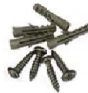
Installation Screw Packet